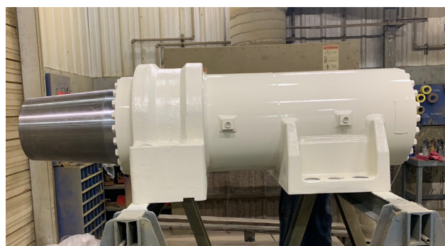
Komatsu 930E Front Suspension