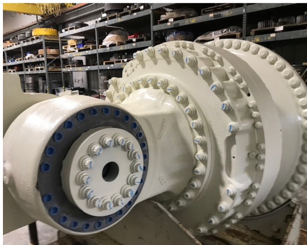
Komatsu 930E Spindle, Hub and Brake

With high levels of attention to detail and best practice, we give safe and consistent repairs that will achieve appropriate service life every time. Utilizing H-E Parts premium components has provided the customer with the expectation of extended service life and increased maintenance planning accuracy.