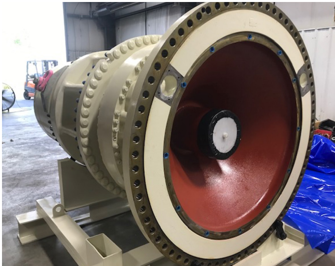
GDY106 Electric Wheel Motor

H-E Parts International replacement parts are compatible with the makes and/or models of the third-party equipment described. H-E Parts International is not an authorized repair facility of these third parties and it does not have an affiliation with any manufacturers of these third-party products. All brands, original equipment manufacturer (OEM) part numbers or references are owned by the respective OEM entities or their affiliates. These terms are used by H-E Parts International for identification and cross reference purposes only and are not intended to indicate affiliation with, or approval by the OEM, of H-E Parts International or its products.