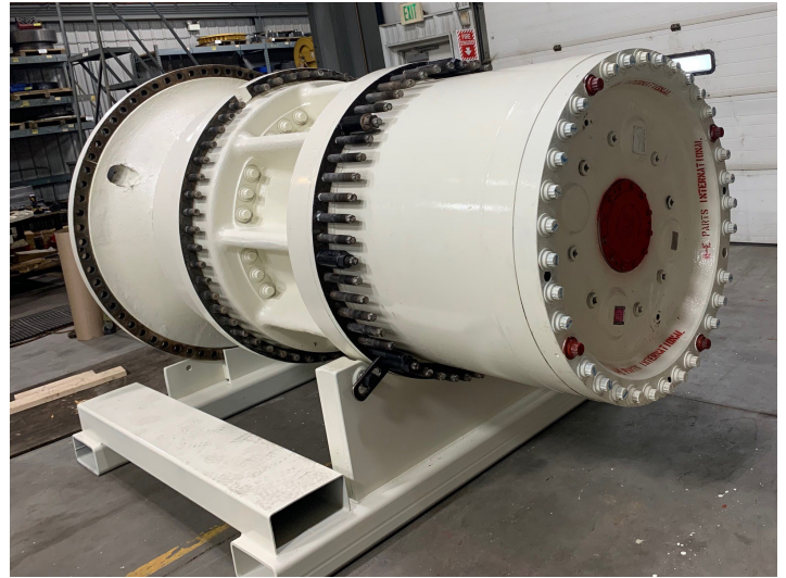
GDY106 Electric Wheel Motor

H-E PARTS HAS DELIVERED OVER 100 COMPONENTS TO THIS CUSTOMER AND CONTINUES TO PARTNER ON OUR MULTI-YEAR AGREEMENT TODAY.