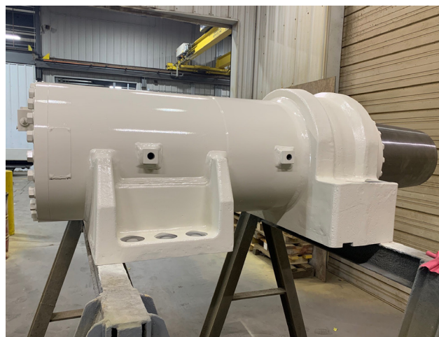
Komatsu 930E Front Suspension