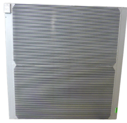
COR Cooling™ Hydraulic Oil Cooler