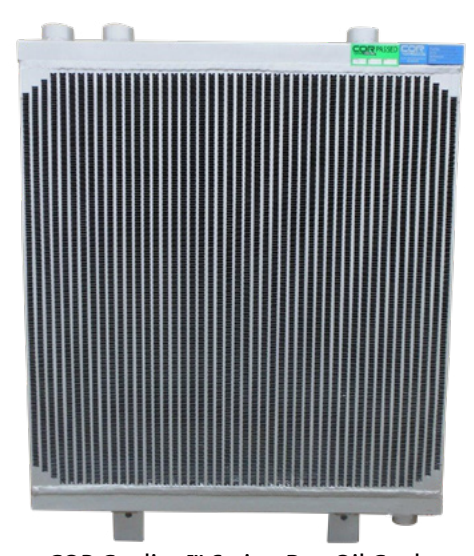
COR Cooling™ Swing Box Oil Cooler

H-E Parts International replacement parts are compatible with the makes and/or models of the third-party equipment described. H-E Parts International is not an authorized repair facility of these third parties and it does not have an affiliation with any manufacturers of these third-party products. All brands, original equipment manufacturer (OEM) part numbers or references are owned by the respective OEM entities or their affiliates. These terms are used by H-E Parts International for identification and cross reference purposes only and are not intended to indicate affiliation with, or approval by the OEM, of H-E Parts International or its products.