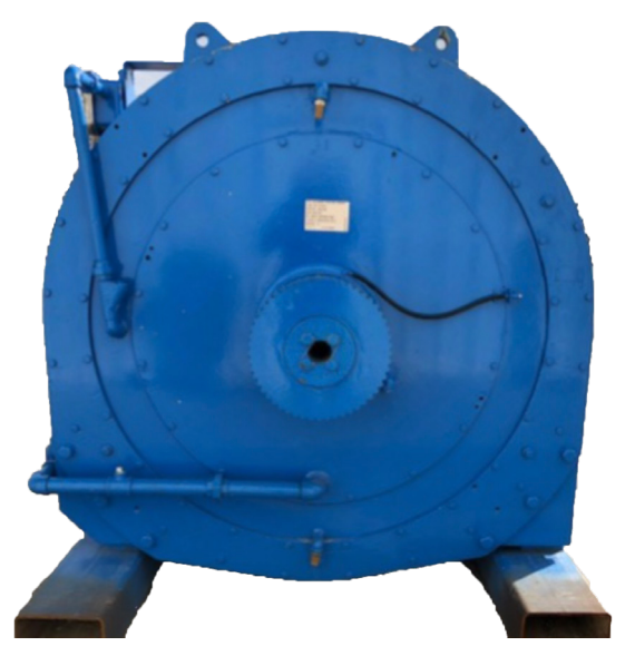
BAYLOR EDDY CURRENT BRAKES