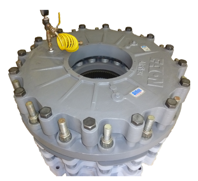
WATER COOLED BRAKES