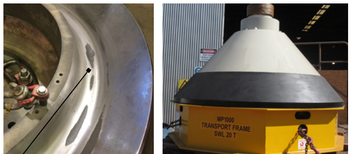
Upper head section ready for repair

H-E Parts International replacement parts are compatible with the makes and/or models of the third-party equipment described. H-E Parts International is not an authorized repair facility of these third parties and it does not have an affiliation with any manufacturers of these third-party products. All brands, original equipment manufacturer (OEM) part numbers or references are owned by the respective OEM entities or their affiliates. These terms are used by H-E Parts International for identification and cross reference purposes only and are not intended to indicate affiliation with, or approval by the OEM, of H-E Parts International or its products.